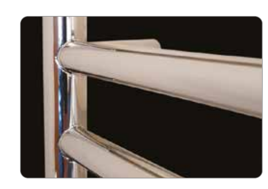
Wall to front face = 88-100mm Wall to pipe centre = 72-94mm

The brackets are designed to be installed using the smallest measurement - however, the adjustment is available, where required, for fitting purposes.